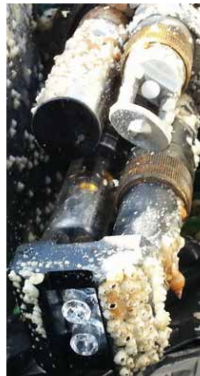
Clean sensor faces after nine months in-situ.