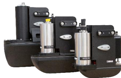
125 kHz, 250 kHz and 500 kHz transducers